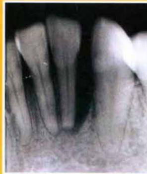
Before Perio Protect® treatment