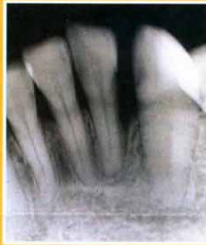
After Perio Protect® treatment